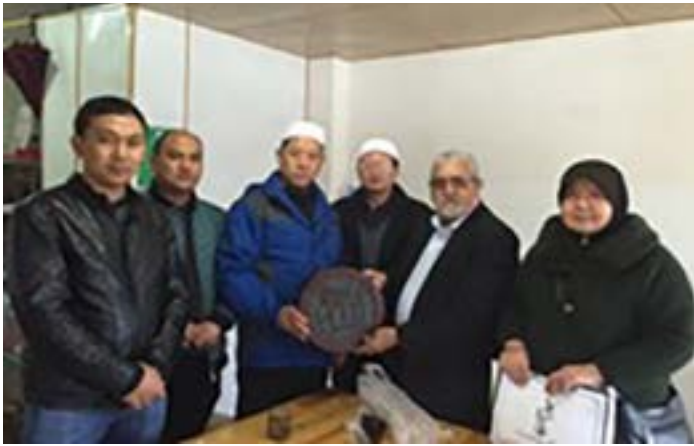
Group photo taken with Xida Islamic Education College staff.

I also visited the Grand Mosque of Shadian, covering an area of 17,708 square meters with two 93 meter high towers. We exchanged ideas and there is great potential to enhance the educational aspects, environment and methodologies, through close interaction between our schools. They expressed that they are very interested to visit our school and also participate in camping whilst in Melbourne.