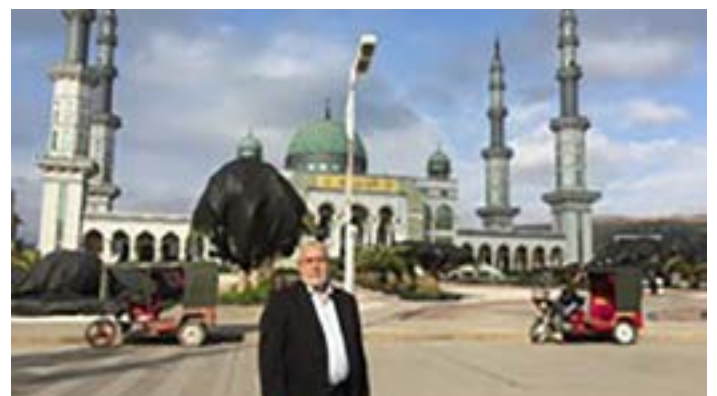
Outside the Dong Guan Mosque

During the holidays, I had the opportunity to visit Laojie Mosque (150 years old) established in 627AD by Sa'd ibn Abi Waqqas and Xida Islamic Education College (with more than 500 students, boys and girls) in Jijie Town. I found the visit very enriching which increased my knowledge about Muslims in China having met the Imams,