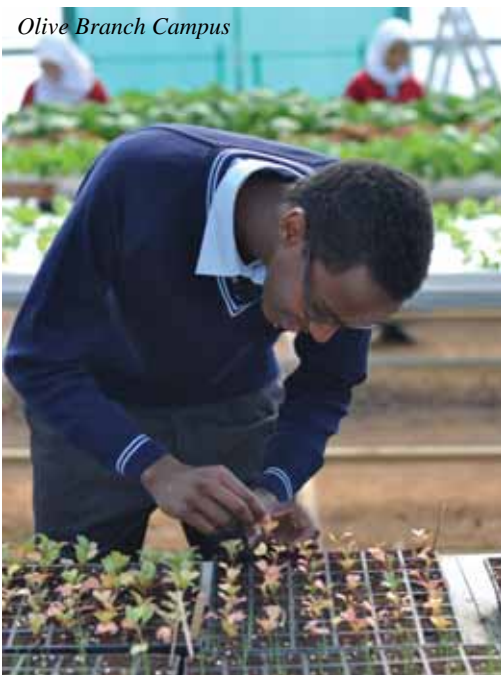
Olive Branch Campus

Al-Taqwa College established a horticultural and agricultural campus in Derrimut Road, Tarneit. The campus is now RTO accredited delivering nationally recognised and accredited training and assessment services.